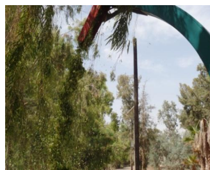
Plate 3. Cutting output