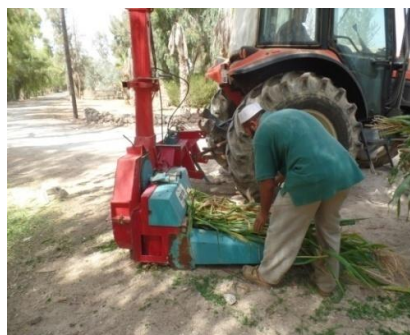
Plate 2. Feeding of the machine