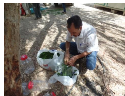
Plate 4. Filling process