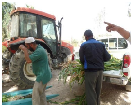
Plate 1. Corn fodder before cutting

Plates 1 to 4 show steps 1 to 4 of samples preparing for fermentation. The fodders of green corn and the alfalfa were brought and introduced to a device slicing machine which was used to cut the plants into small homogeneous pieces. The fodder mixtures were then prepared with a varying ratio in preparation for 50 days of fermentation (Table 1). Crude protein level test was carried out after fermentation in the research center forage lab.