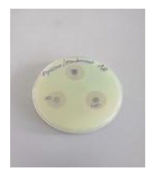
Fig. 1. Anti microbial activity of silver nanoparticles against Pseudomonas ESBL is effective as the zone of inhibition is maximum

ESBL strains are resistant to most antibiotics like penicillin, cephalosporins etc [22,23]. Therefore finding a preparation against its activity is necessary as far as its prevalence is concerned.