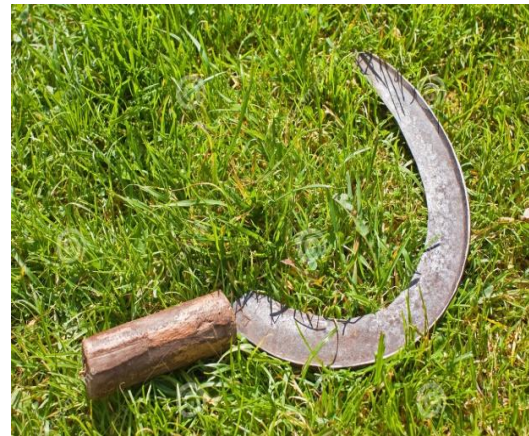
Fig. 2. Manual harvesting with sickle