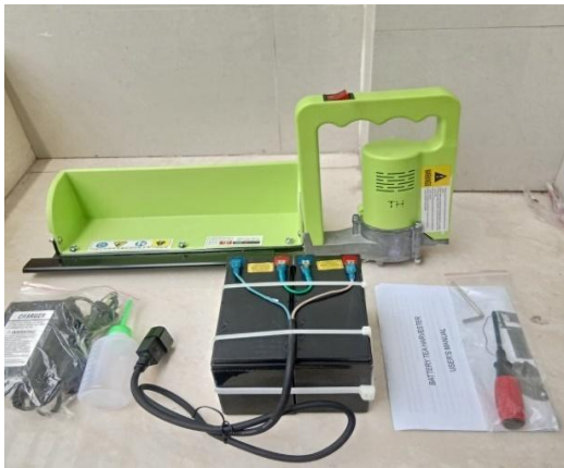
Fig. 3. Battery operated leafy harvester