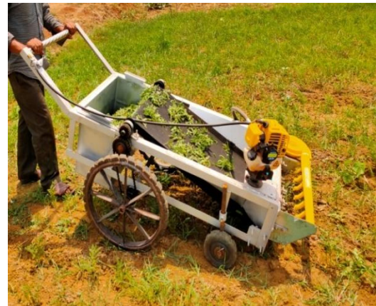
Fig. 4. Manual push type engine operated leafy crop harvester