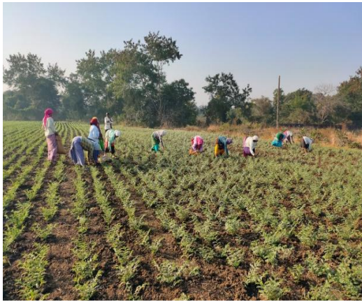
Fig. 1. Manual hand plucking