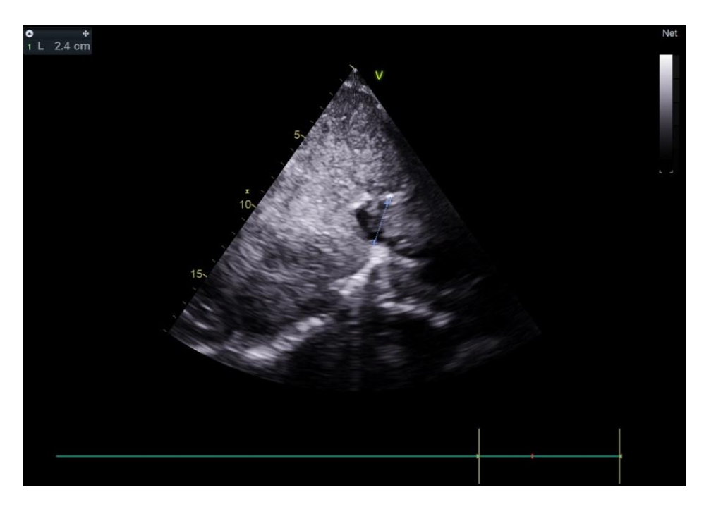
Fig. 2. TTE showing the intra-Inferior Veina cava mass measuring 24mm