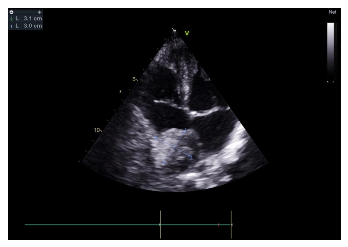
Fig. 1. TTE showing a right intraauricular hyperechogenic mass measuring 31*30mm

The patient started anticoagulation. Gastrology team evaluated him and they determined he was not a candidate for surgery. He was discharged with a plan to receive palliative treatment as an outpatient, and unfortunately, he passed three months after the diagnosis.