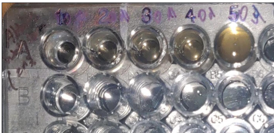
Fig. 3. Evaluation of antioxidant activity