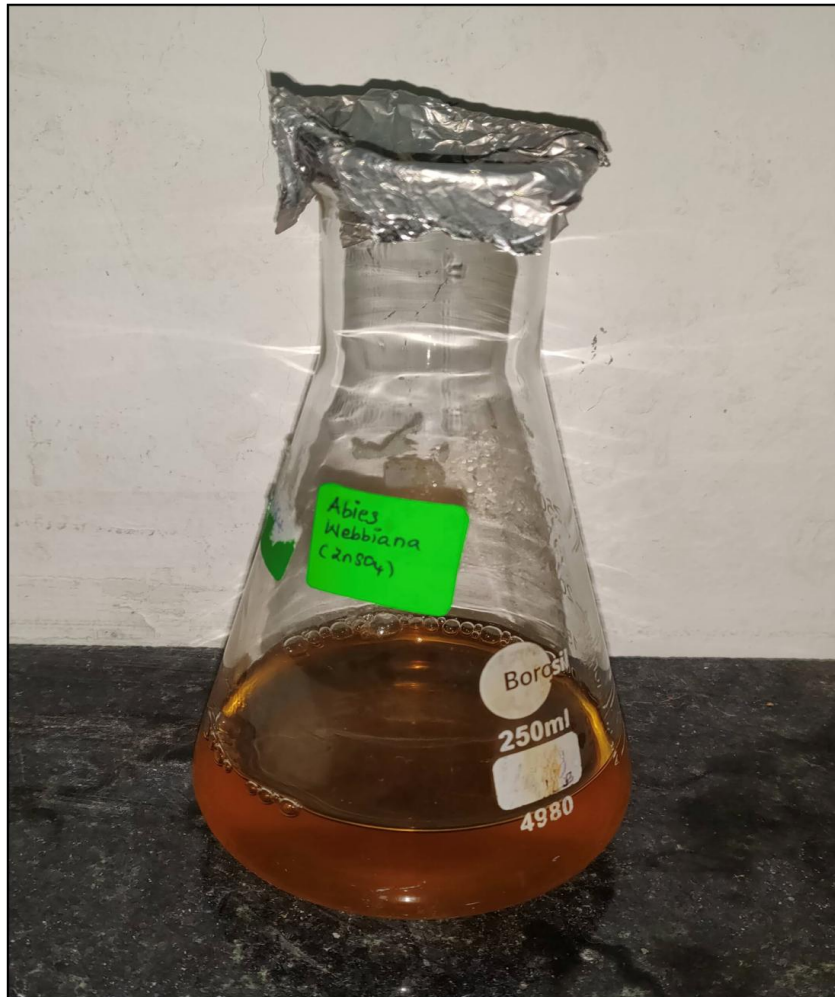
Fig. 1. Visual observation of colour change