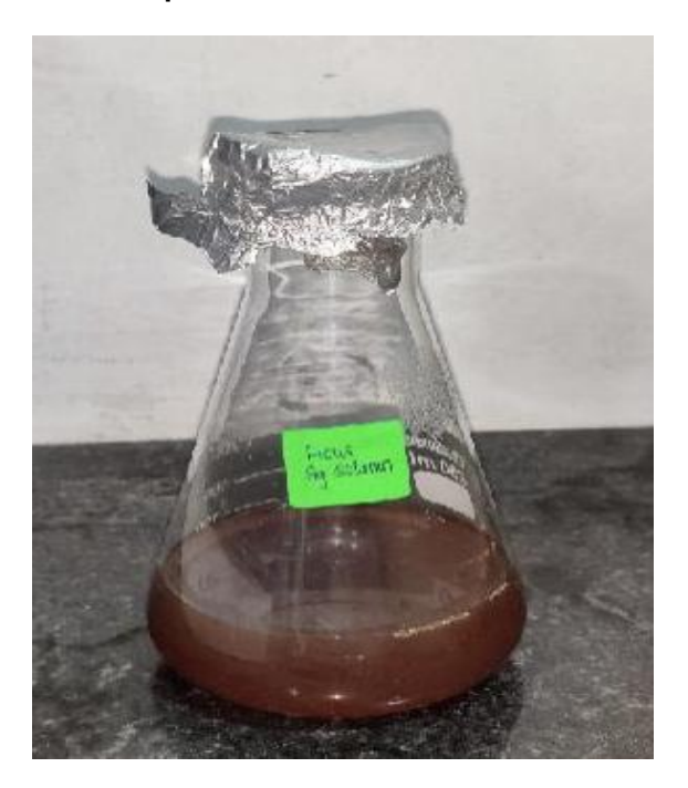
Fig. 2. Reduction of silver ions to silver nanoparticles visually identified by color change

Fig. 1. Brine shrimp lethality assay comprising ELISA plate wells with different concentrations of F. benghalensis mediated silver nanoparticles and a control observed for the presence of live nauplii after 24 h and 48 h incubation