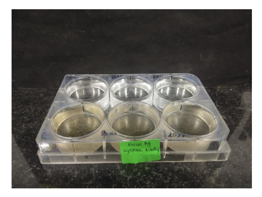
Fig. 1. Brine shrimp lethality assay comprising ELISA plate wells with different concentrations of F. benghalensis mediated silver nanoparticles and a control observed for the presence of live nauplii after 24 h and 48 h incubation

Ranasinghe et al.; JPRI, 33(60B): 3741-3748, 2021; Article no.JPRI.78799