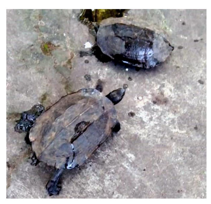
Fig. 2. Specimens of Male and Female Melanochelys trijuga species observed on visual survey

undergo loss of biodiversity [7,8]. The present rate of anthropogenic activity and climate change shifts their major drives of habitat loss, habitat fragmentation and cause major decline of turtles. On the other hand, many freshwater turtle species are exploited for food and pet trade. The people with less or no knowledge of turtle habitat result in the death of the pet specimen.