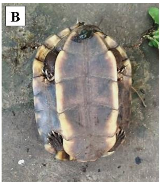
Fig. 3. Carapace and Plastral view of adult Melanochelys trijuga species