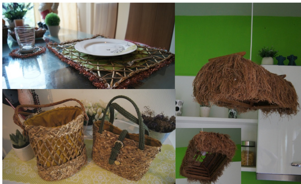
Figure 3. Samples of environmentally friendly product designs from rice stumps for community economy