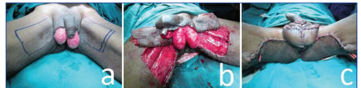
[Table/Fig-6]: a) Left- >75% loss of scrotum following debridement with marked bilateral medial thigh flaps in a Fournier's gangrene patient; b) Middle- Debridement of the raw area and harvested flaps; c) Right- Good coverage achieved after inset of the flaps and donor site closed primarily.

The most common scrotal reconstruction procedure performed in the present study was Singapore flap [Table/Fig-3]. According to the defect size and laxity of local tissue, unilateral and bilateral Singapore flap done for the patients, followed by local tissue arrangements, STSG and other local fasciocutaneous flaps. Unilateral or bilateral medial thigh flap and local random flaps included in other local fasciocutaneous flaps. Scrotal debulking and primary z-plasty closure included in the local tissue arrangements along with cases of scrotal tissue loss which were managed with adjustment of remaining scrotal tissue. Two patients were allowed to heal by secondary intention [Table/Fig-4-7].