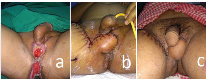
[Table/Fig-3]: a) Left- Traumatic loss of scrotum >75% with exposed testis with perineal wound; b) Middle- Right sided Singapore flap done to cover the scrotum and skin graft for perineal wound; c) Right- Three weeks postop showing that flap is well settled.

by debridement and STSG. Both patients were follow-up case of Fournier's gangrene and both are diabetic. Time of recovery was calculated from time since final reconstruction to discharge from the hospital. It was maximum in Fournier's gangrene patients and minimum in patients with congenital bifid scrotum.