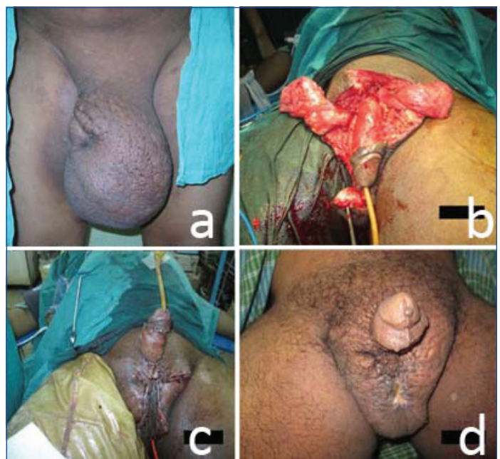
[Table/Fig-1]: a) Top left- Scrotal lymphoedema with buried penis; b) Top right- After debulking scrotum and degloving the penis; c) Bottom left- Immediate postoperative pictures of neo-scrotum and grafted penile shaft; d) Bottom right- 3 months Postop.

The time interval between initial presentation and final reconstruction is highest for the patients with Fournier's gangrene followed by patients with traumatic loss of scrotal tissue. Early reconstruction performed in three cases where patients were optimised. Rest of the cases were dressed regularly with normal saline till the wound matures. Elective surgical reconstruction planned for rest of the cases. Debulking of scrotum was performed in scrotal lymphoedema. In all the cases corrugated drain were used. In one case that was associated with Ram's horn penis, penile degloving and STSG was done along with scrotal debulking [Table/Fig-1]. Congenital bifid scrotum was treated with by Z-plasty [Table/Fig-2]. Tunica vaginalis was open and everted bilaterally and septum created by attaching both the testis. Closure was done with anterior and posterior multiple z-plasty with skin and dartos in one layer.