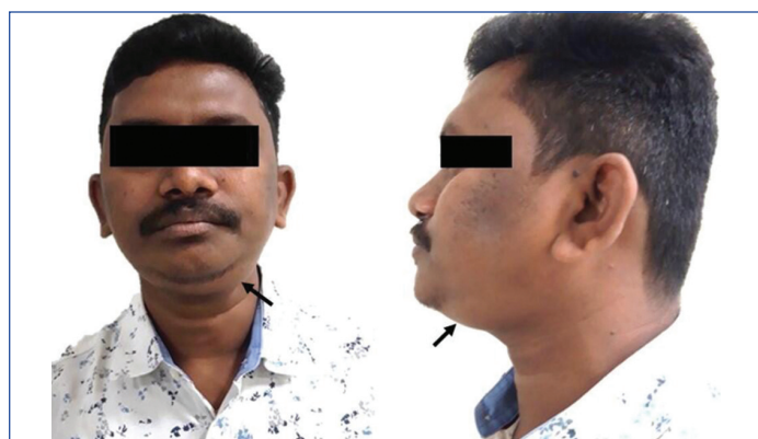
[Table/Fig-1]: Extraoral swelling in the left submandibular region.

Complete blood picture and the thyroid profile were within normal bounds. Mandibular left lateral occlusal radiograph revealed a root stump in relation to 37 tooth number [Table/Fig-3]. Ultrasonography (USG) of the swelling revealed an anechoic, bilobed fluid collection in the left submandibular area with a superficial and deep component extends along the fascial plane features confirming the diagnosis [Table/Fig-4a-c]. Magnetic Resonance (MR) sialogram with Computed Tomography (CT) screening revealed a dilated left submandibular duct in the floor of the mouth and thickened defect of the mylohyoid muscle with sublingual gland herniation, depicting the pathognomic "Tail sign". Interpretation revealed case of plunging ranula that extends posteriorly to the left submandibular space [Table/Fig-5a,b]. The patient is under regular follow-up and has been planned for surgical management.