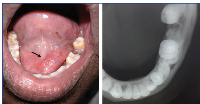
[Table/Fig-2]: A dome-shaped swelling in the left floor of the mouth.