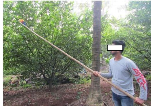
Plate A. Atul Sapota harvester

evaluated in terms of harvesting capacity (kg/h), damage fruit per cent (%), total harvesting time (h). The following observations were taken during field performance of DBSKKV, Dapoli developed fruit harvesters.