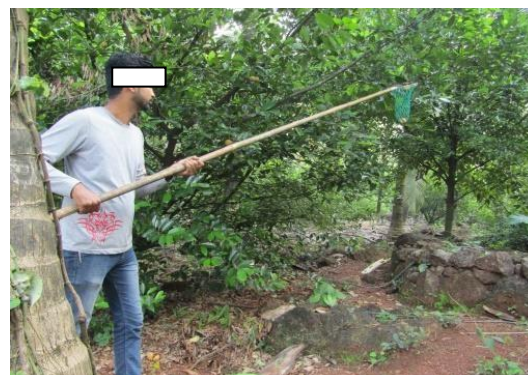
Plate C. Naveen mango harvester