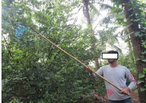
Plate D. Multi fruit harvester