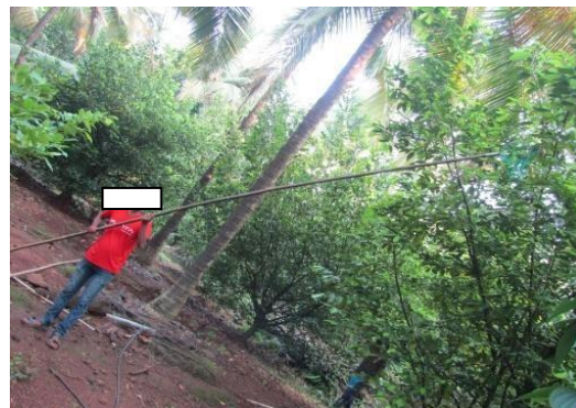
Plate B. Nutan Mango harvester