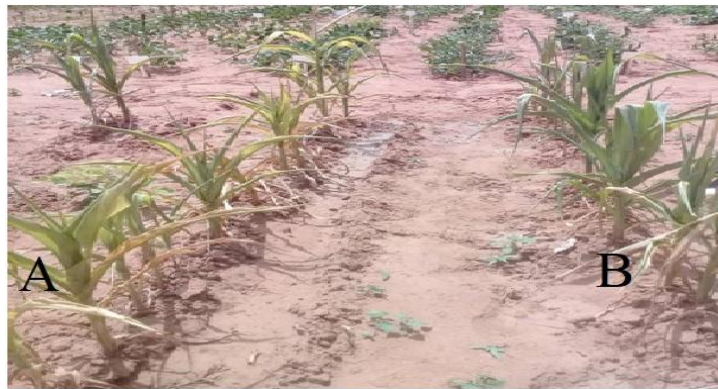
Plate 1. Genotypic differences in curling and chlorophyll concentration among the genotypes in Lusitu

**, *** data significantly different from zero at P \leq 0.05 , P \leq 0.01 , P \leq 0.001 respectively and SOV – source of variation. TBM-total biomass, VIG-vigour, RL-root length, RBM-root biomass, SBM-shoot biomass, CCI-Chlorophyll concentration index, PH-plant height and Cur – Curling