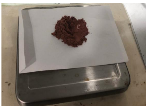
Fig. 1 Weighing 1g of Pterocarpus santalinus and Stevia herbal formulation