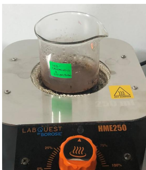
Fig. 2. Heating Pterocarpus santalinus and Stevia extract at 70°C for 10 minutes for the preparation of plant extract