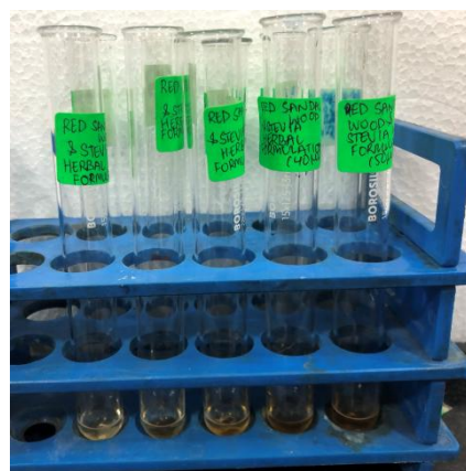
Fig. 3. Antioxidant activity performed by adding 1ml of DPPH in methanol and then the reduction in the quantity of DPPH free radicals was assessed dependent on the absorbance at 517nm