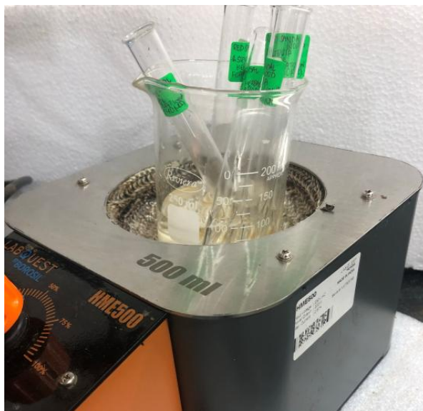
Fig. 4. Antidiabetic activity was performed by adding DNSA reagent to stop the reaction and the solution was heated in a water bath for 5 minutes

software. Only antidiabetic and antioxidant activity was performed. In future studies, cytotoxicity and antimicrobial activity will be performed.