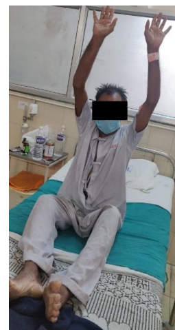
Fig. 3. Patient performing active range of motion exercise of upper limb post ICD removal