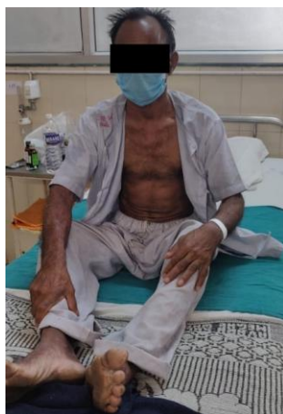
Fig. 2. Patient in long sitting Post ICD removal