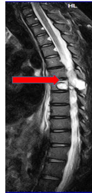
Figure 2. Spinal MRI showing high intensity on T2 at the level of T2 thoracic vertebra with bone marrow involvement.